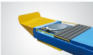
▲ Optional Turnplate each alignment lift needs one set (two pcs.) of turnplates. Kits No.:40101(Only PX09A)