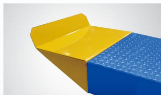
▲ Optional extension platform. kits no.:PX001 (for PX09), Px002 (for PX09A)