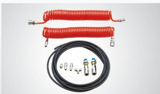
▲ Optional air line kits (kits no.: Px004)