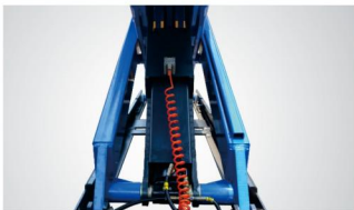
▲ Electro-air control system, mechanical safety locks.