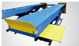
▲ Nice design pull-out tool tray comes as standard.