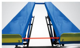
▲ Equipped with photocell configuration as standard to ensure the equalization of both platforms.