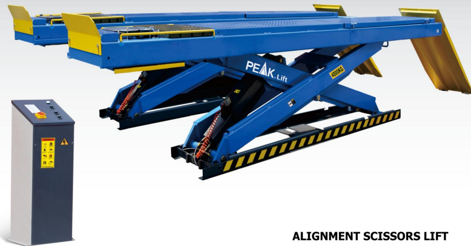
ALIGNMENT SCISSORS LIFT