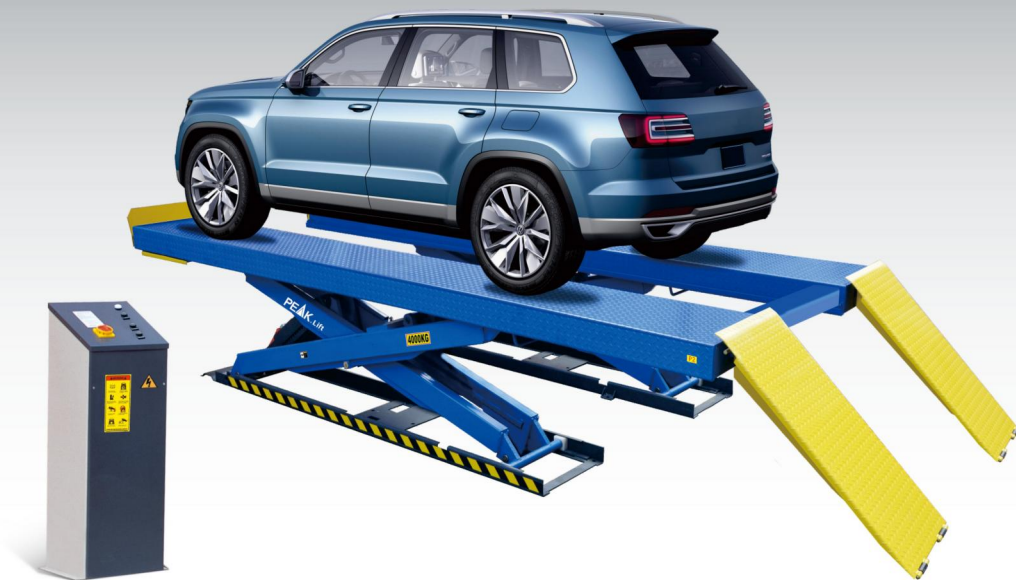
GENERAL SERVICE SCISSORS LIFT