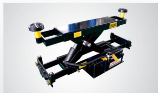
▲ Optional rolling jacks J6H:manual hydraulic type 2.8T J6A:pneumatic hydraulic type 2.8T