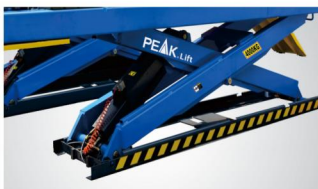
▲ Heavy duty design with robust X scissors made of large steel tubes to ensure strong capabilities under heavy workloads.